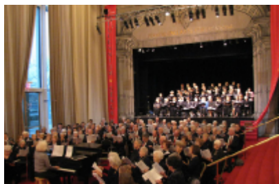
Encore Senior Chorale performing at the Kennedy Center. They will perform at the Workhouse on Saturday, May 1.