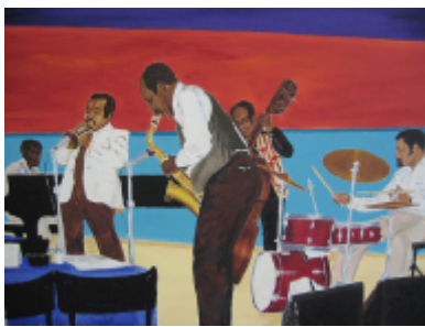
Cookin' Outside by Cedric Baker