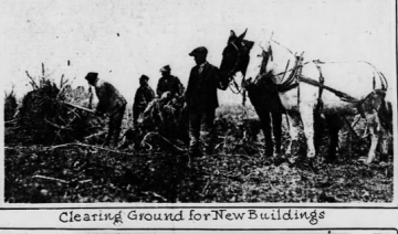
Clearing Ground for New Buildings