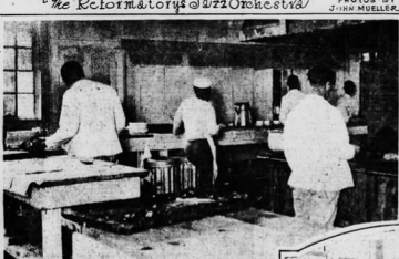
The Reformatory Kitchen