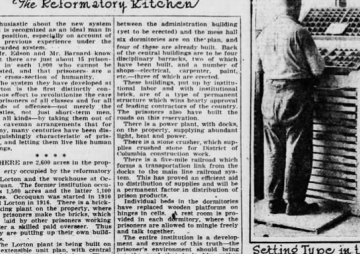
Setting Type in the Reformatory