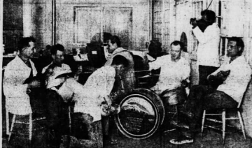
The Reformatory's Jazz Orchestra