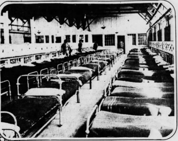
Dormitory at Lorton Reformatory